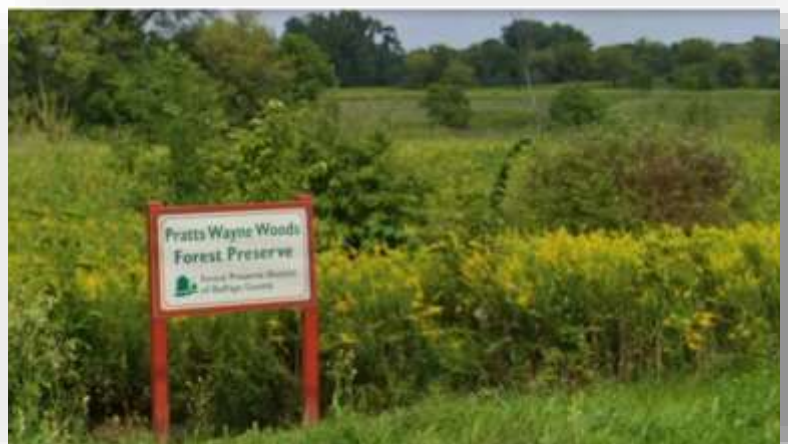
The body of a 26-year-old Round Lake man was found Thursday morning in Pratt's Wayne Woods Forest Preserve in west suburban Wayne.

To everybody who was involved and changed their schedules to help, I can't thank you enough. This was our first callout from the forest preserve and was a direct result of the awesome job we did working the multi-agency training exercised at Blackwell Forest Preserve last year.