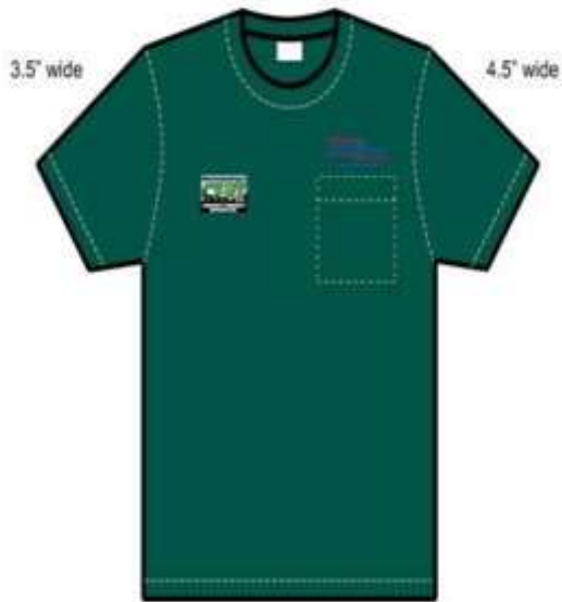
*shown on adult large tee